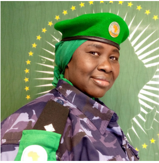
AIP KAREO ROSE LOGI