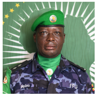
IP. MPIIMA MICROSE LYADA