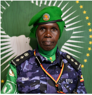
SSP. OBOL HELLEN