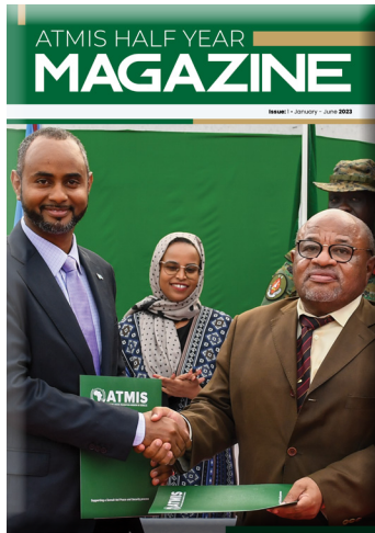
Somalia's Federal Minister of Defence Abdulkadir Mohamed Nur (left), shakes hands with the SRCC and Head of ATMIS, Amb. Mohamed El-Amine Souef (right), at a ceremony to officially hand over six Forward Operating Bases to the Federal Government of Somalia in Mogadishu on 6 July 2023.