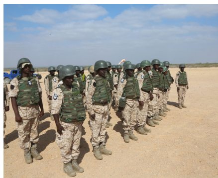
Troops from the 10th Battalion of the Djiboutian Contingent on parade after arriving in Jalalaqsi on 9 February 2023.