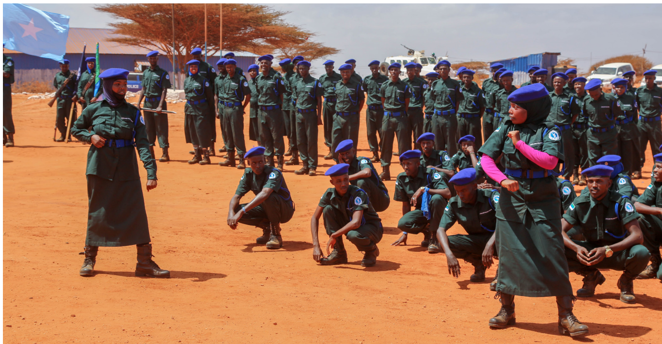
Newly trained women Somali Police Officers (SPF) in Jubaland State show off skills acquired during training at their passout ceremony in Kismayo on 4 February 2023.

The training is supported by ATMIS and other development partners under the Joint Police Programme and aims to strengthen Somalia's policing capacity in both urban and rural areas.