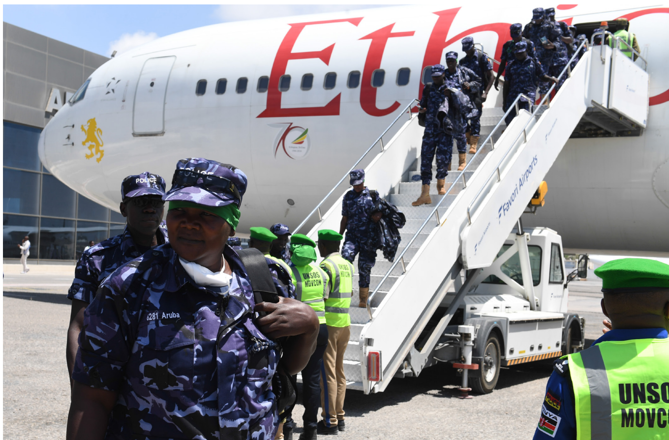
Newly deployed Ugandan Formed Police Unit (FPU) personnel serving with the ATMIS disembarking from an aircraft upon arrival at Aden Abdulle International Airport in Mogadishu on 1 March 2023

Uganda is one of the ATMIS Police Contributing Countries (PCCs), together with Ghana, Kenya, Nigeria, Sierra Leone, and Zambia.