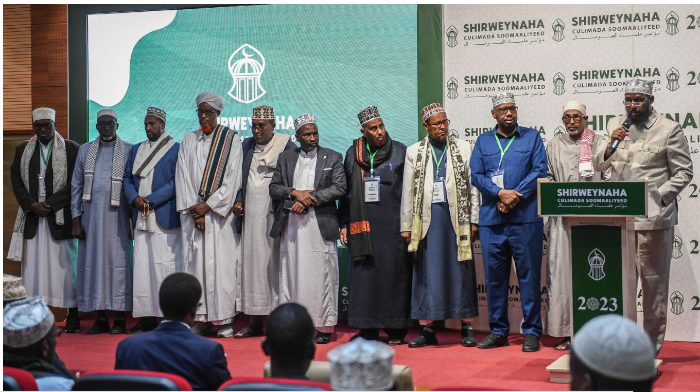
Somali clerics attend a conference on religious extremist ideologies in Mogadishu on 26 January 2023. The conference organised by the Somali Federal Ministry of Religious Affairs and Endowment, attracted at least 300 religious scholars and clerics.

Speaking at the closing ceremony, the Prime Minister, H.E. Hamza Abdi Bare, welcomed the declaration and thanked the clerics for their selfless service to the country, promising full implementation of the fatwa.