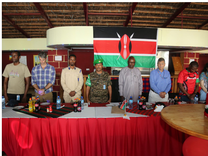
Senior ATMIS officials and invited guests stand to the Kenyan national anthem during an event organised by Kenyan troops to mark the 60th Madaraka Day at the Sector Six Headquarters in Kismayo on 1 June 2023.

Under ATMIS deployment, Kenyan troops are based in Sector Two which is headquartered in Dhobley town along the Kenya-Somalia border and Sector 6 in the southern port city of Kismayo which they jointly secure with Ethiopian troops.