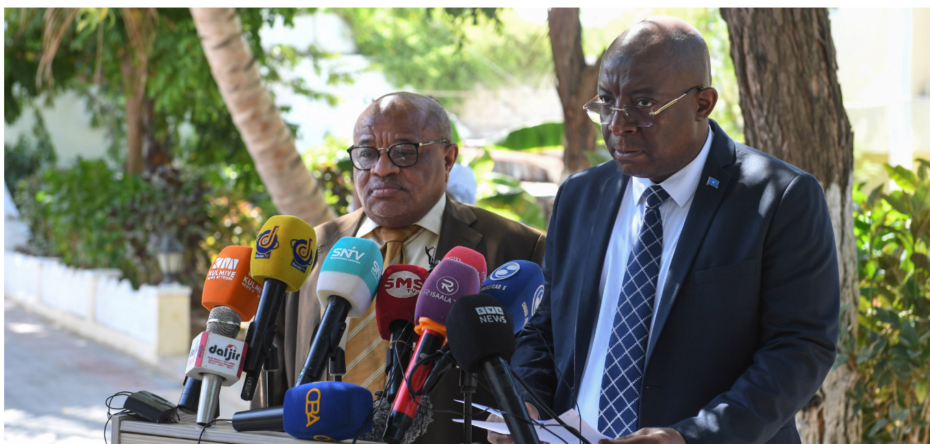
The SRCC and Head of ATMIS, Amb. Mohammed El-Amine Souef (left), and Somalia's Minister of Information, Culture and Tourism Daud Aweis Jama (right), address press conference on joint military operations against Al-Shabaab at the Villa Somalia in Mogadishu on 7 June 2023.

In line with the UN Resolution 2670, ATMIS is expected to drawdown 2000 troops by the end of this month in a phased hand over of security responsibilities to the Somali security forces in the implementation of the Somali Transition Plan. The AU peace Mission is expected to fully exit Somalia by 31 December 2024.