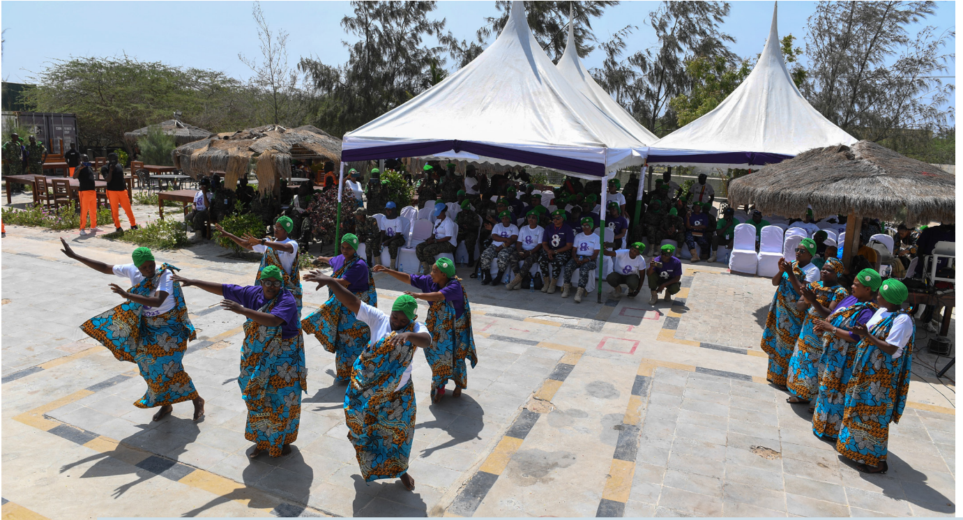
Women peacekeepers serving with ATMIS perform a traditional dance during celebrations to mark the International Women's Day held in Mogadishu on 8 March 2023.

“Gender Equality prevents violence against women and girls, while gender inequality is a root cause of violence against women. ATMIS will continue to promote gender equality because women living from fear and violence is a basic human right,” said Col. Sesay who spoke on behalf of the military component.