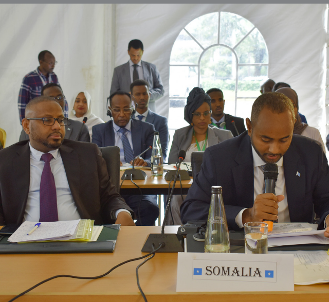
Somalia's Minister of Defence Abdulkadir Mohamed Nur, during a meeting of representatives of ATMIS Troop Contributing Countries in Kampala, Uganda, on 26 April 2023.