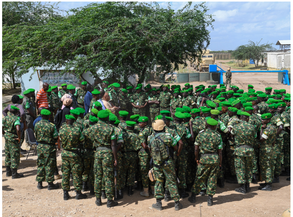
The SRCC and Head of ATMIS, Amb. Mohammed El-Amine Souef, addresses Burundi National Defence Force (BNDF) troops at Sector Five Headquarters in Jowhar on 10 May 2023.

The drawdown is in compliance to United Nations Security Council Resolutions (UNSCR) 2628 and 2670 which mandates ATMIS to drawdown 2000 soldiers by the end of June and hand over security in agreed areas to Somali Security Forces (SSF).