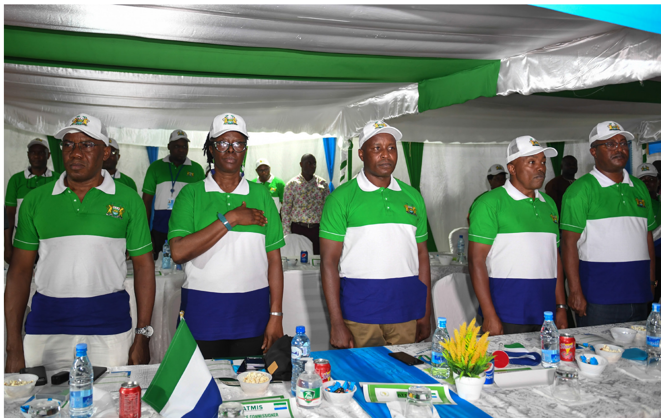
Senior ATMIS officials stand in respect of the national anthem during celebrations to mark Sierra Leone's 62nd independence anniversary in Mogadishu on 27 April 2023.

Sierra Leone is a Police Contributing Country (PCCs) to ATMIS. It contributes military Staff Officers, a contingent of a Formed Police Unit and Individual Police Officers.