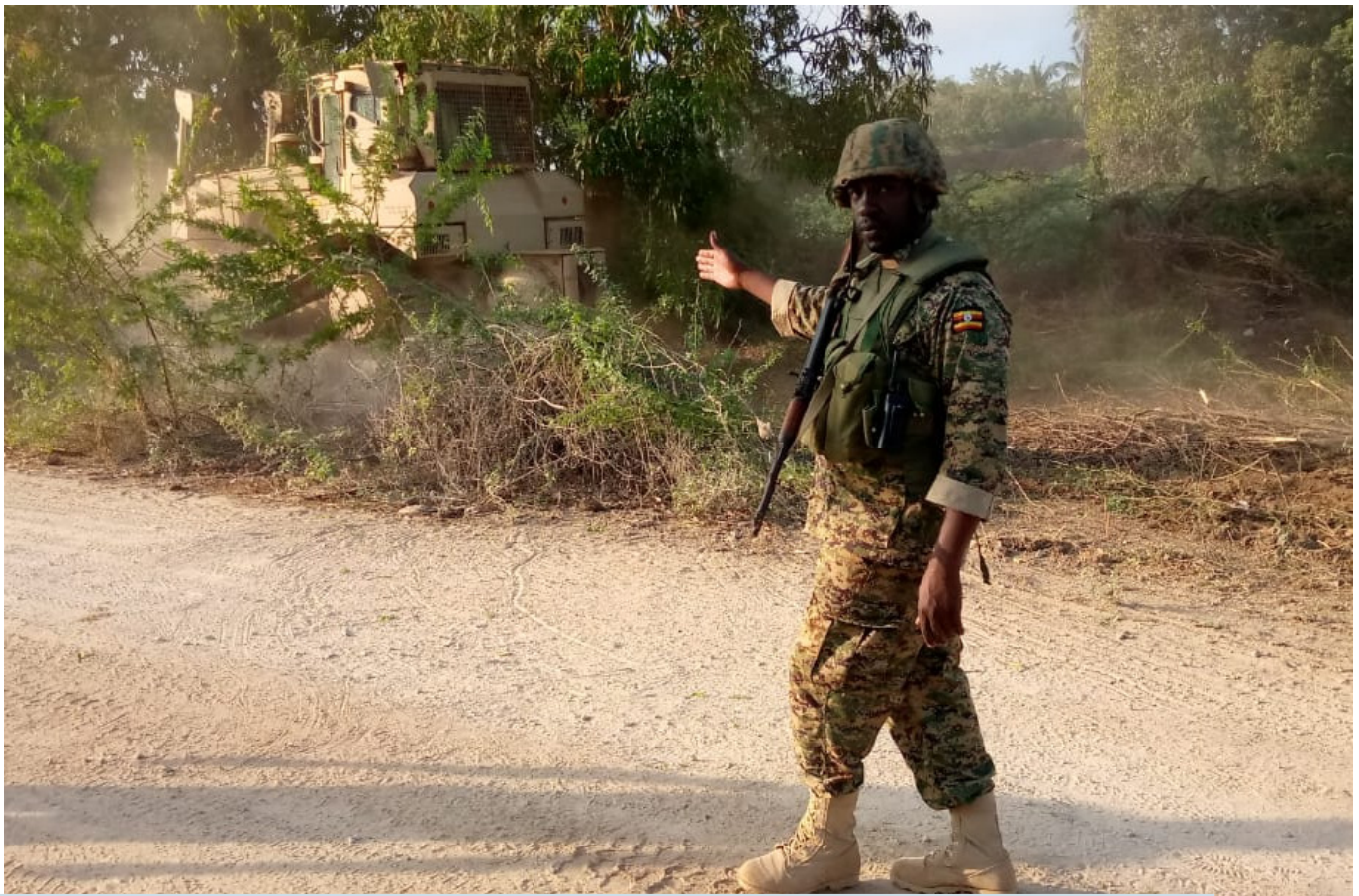
An ATMIS Uganda soldier directing ATMIS road construction machine clearing bushes along the Buufow-Janaale main supply route in Somalia on 25 February 2023.