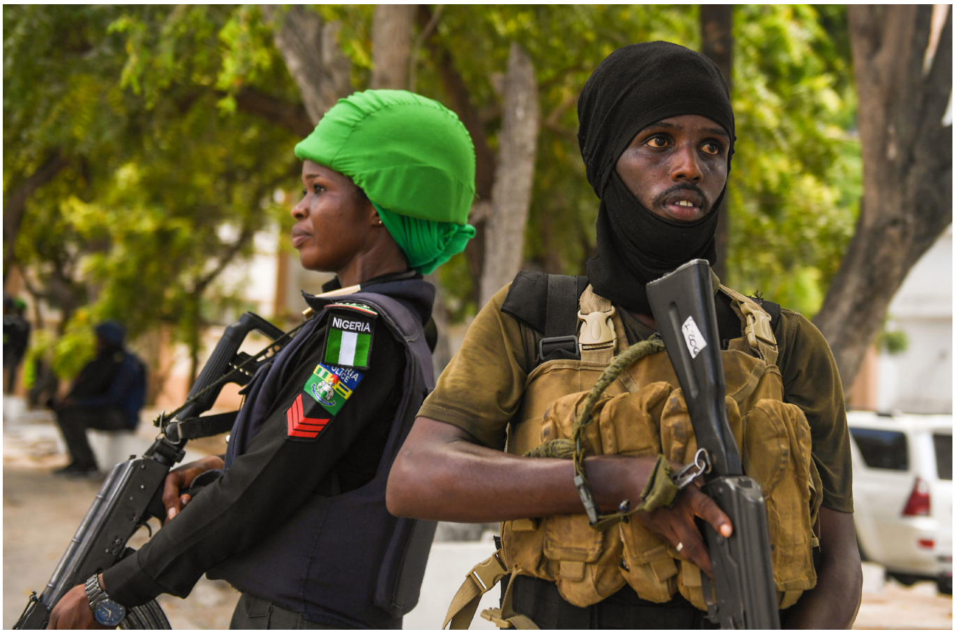
Police officers serving with ATMIS and Somali Police Force patrol a street to keep civilians safe during the Holy Month of Ramadan in Mogadishu on 29 March 2023.

ATMIS Police and SPF also conduct regular joint patrols in the Federal Member States as part of efforts to build the capacity of the local security forces.