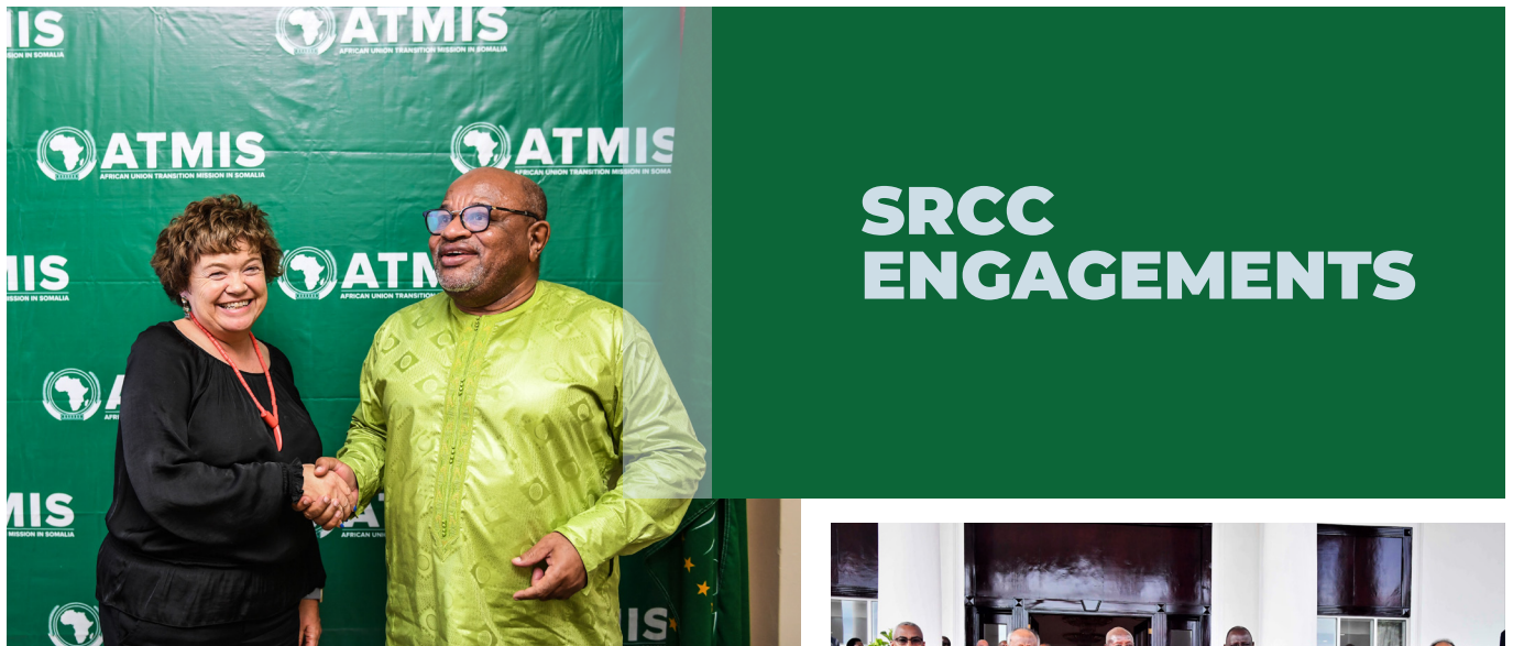
6 June 2023 - The SRCC and Head ATMIS, Amb. Mohamed El-Amine Souef, welcomed the newly appointed UN envoy to Somalia, Catriona Laing, at the ATMIS Mission Headquarters in Mogadishu. The two envoys discussed the status of Somalia's security, the peacebuilding process and the existing cooperation between the African Union and the United Nations.