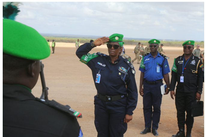
The new ATMIS Police Commissioner, (CP) Hillary Sao Kanu, lands at Ugaas Khalifa International Airport for a familiarization visit to Sector Four in Beletweyne on 29 March 2023.