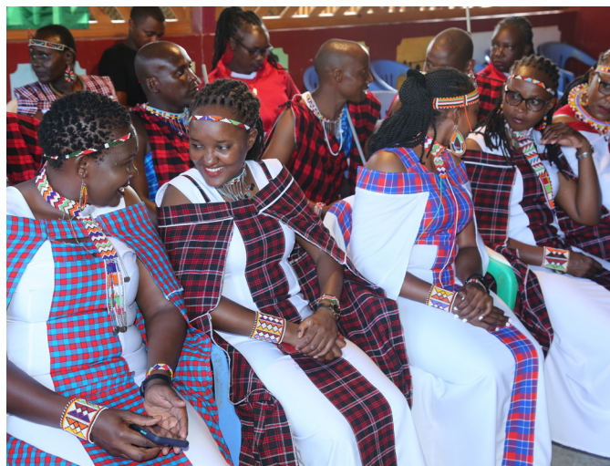
Kenyan troops serving with ATMIS chat during an event to mark the 60th Madaraka day at the Sector Six Headquarters in Kismayo on 1 June 2023.