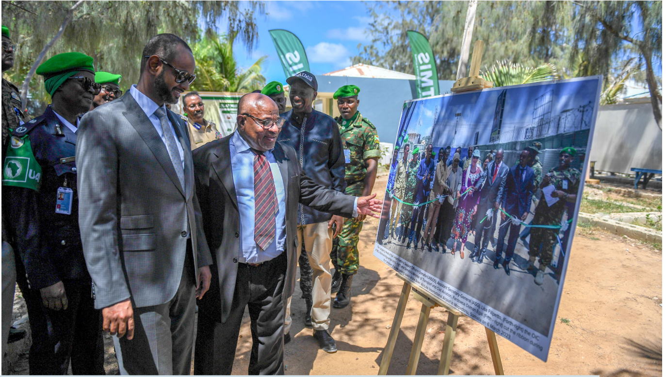
On 1 April, ATMIS marked its first anniversary with a solid commitment to strengthen cooperation with the Federal Government and build new partnerships to speed up Somalia's stabilisation.