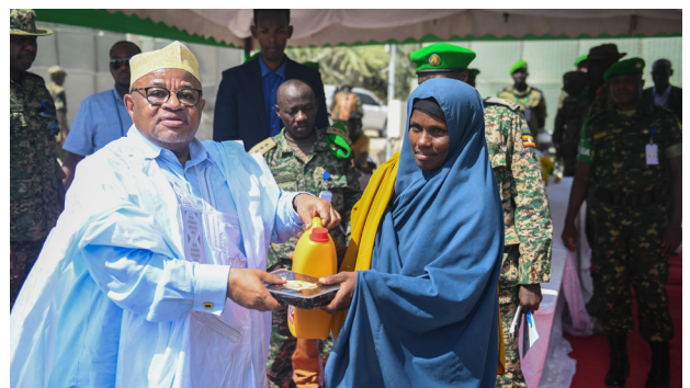
7 April 2023 - To show solidarity with the humanitarian crisis ATMIS donated 3.5 metric tons of assorted food and other items to 75 households of Internally Displaced Persons (IDPs) in the capital, Mogadishu.