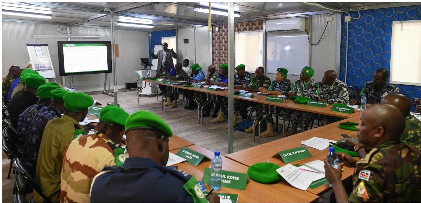
Military and police personnel attending a one-day workshop on environmental sensitisation organised by the ATMIS and the United Nations Support Office in Somalia (UNSOS) in Mogadishu.

On 1 April , ATMIS adopted an action plan that will see the Mission integrate environmental management issues into its operations in Somalia.