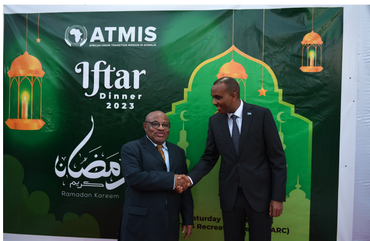
1 April 2023 - ATMIS hosted a Ramadan Iftar dinner for its key partners in Mogadishu. The dinner was attended by dignitaries including Somalia's Prime Minister Hamza Abdi Barre, representatives of international organisations and diplomatic missions.