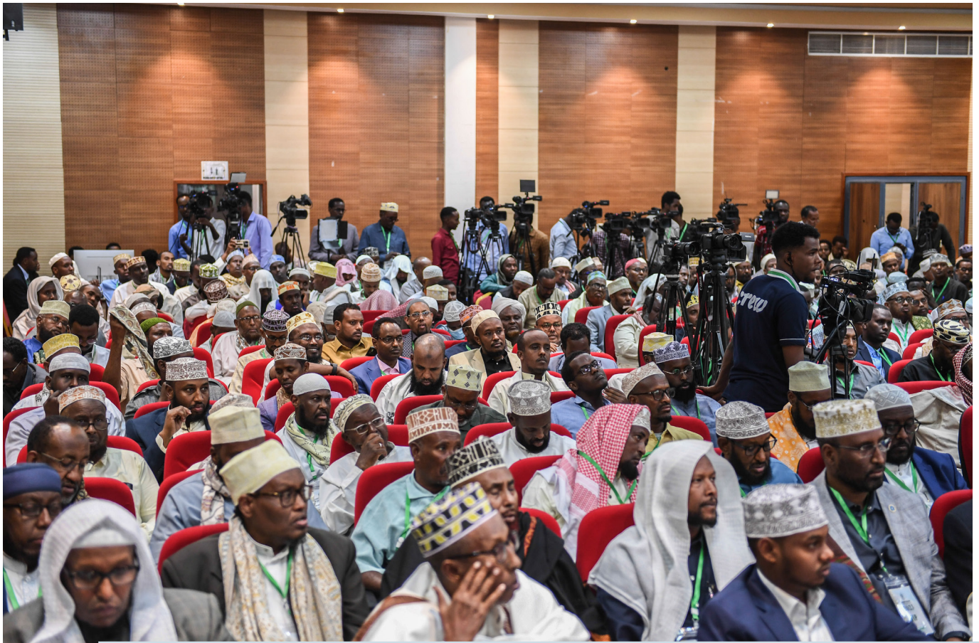
Somali clerics attend a conference on religious extremist ideologies in Mogadishu on 26 January 2023. The conference organised by the Somali Federal Ministry of Religious Affairs and Endowment, attracted at least 300 religious scholars and clerics.

The clerics also called for similar events every year to provide guidance on religious matters and other issues that impact the public.