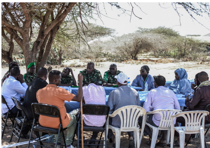
Senior military officers from ATMIS and local community leaders hold talks at the Bal'ad Forward Operating Base (FOB) in Hirshabelle State on 25 January 2023.