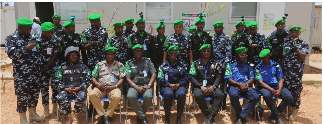
The new ATMIS Police Commissioner, (CP) Hillary Sao Kanu, and senior ATMIS police officers pose for a group photo during a familiarization visit to Sector Four in Beletweyne on 29 March 2023.