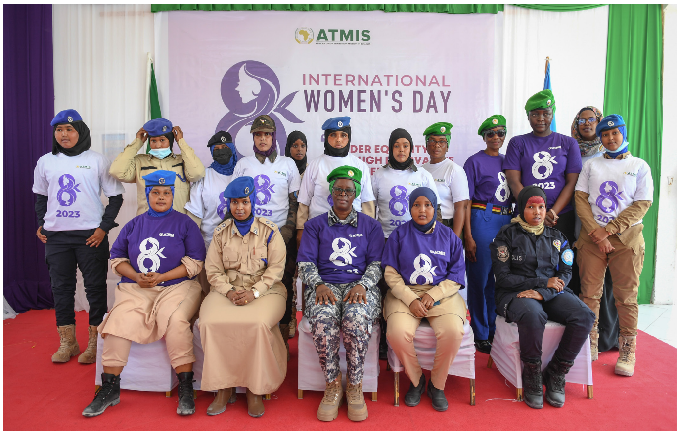
ATMIS and Somali Police Force (SPF) officers pose for a group photo during celebrations to mark International Women's Day held in Mogadishu on 8 March 2023.