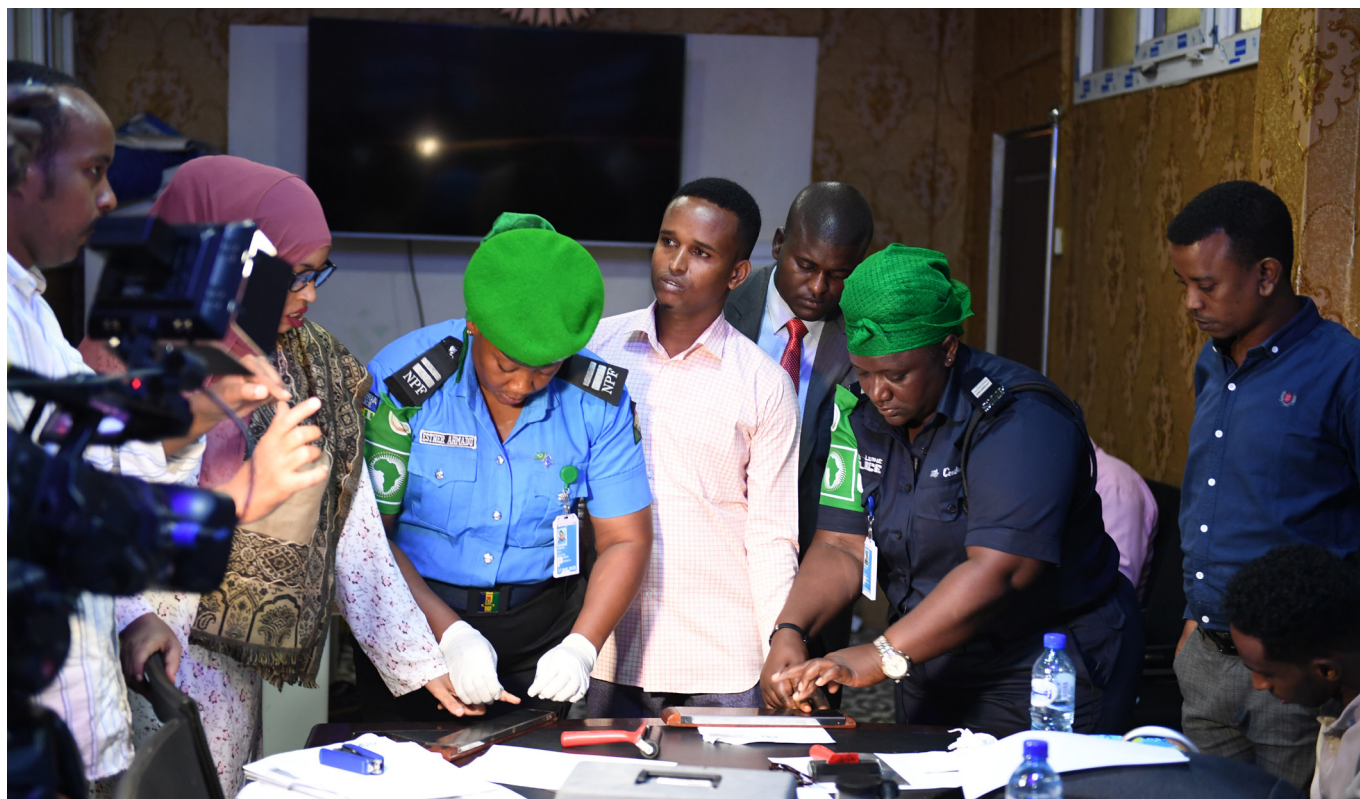
ATMIS police demonstrate how to lift fingerprints at a practical session during a three-day Basic Fingerprint Course for officers of the Somali Police Force, in Mogadishu on 10 January 2023.

The participants were introduced to the history and external structure of fingerprints, types and patterns of fingerprints and the use and characteristics of fingerprints. The investigators were also taught how to file and classify fingerprints.