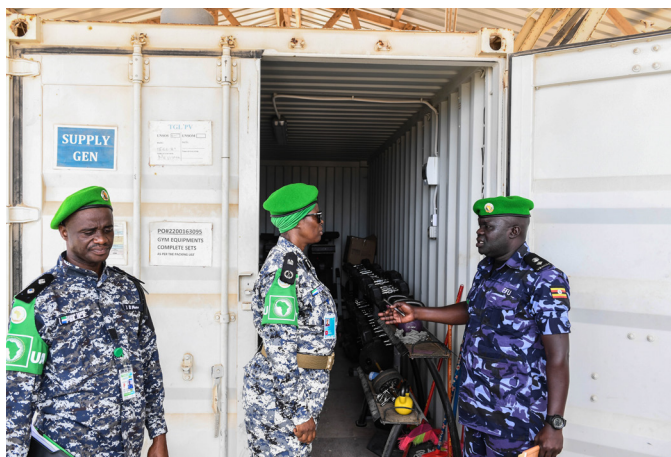
ATIS Police Commissioner CP Hillary Sao Kanu, briefed by the Contingent Commander of the Uganda Formed Police Unit, Superintendent of Police (SP) Juventine Euku, during a visit to the Jazeera basecamp in Mogadishu on 23 March 2023.