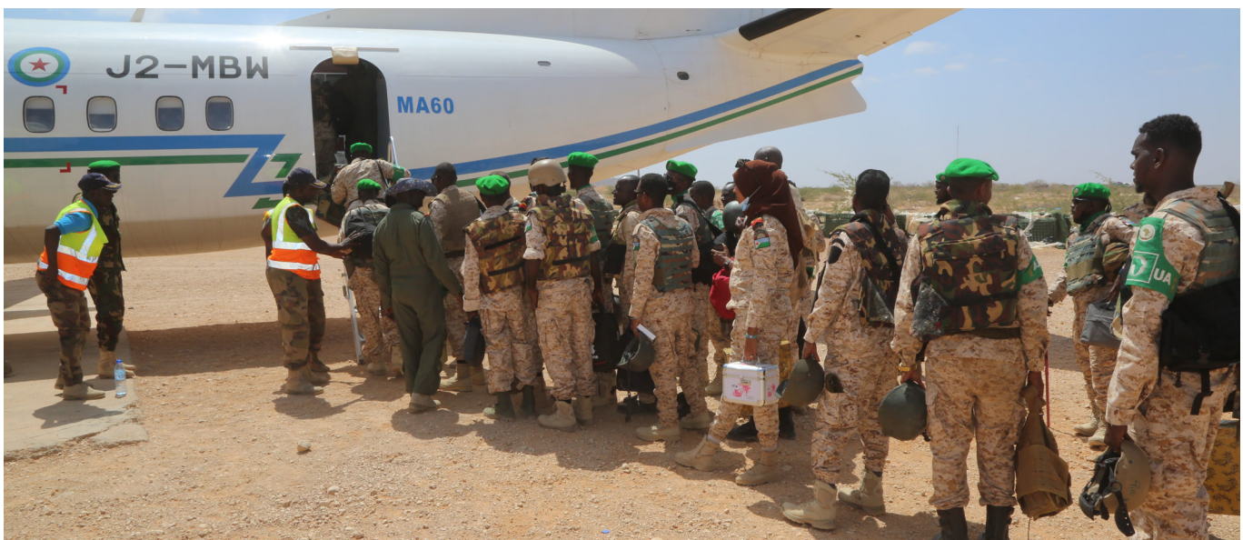
Soldiers from the 8th Battalion of the Djiboutian Contingent board a plane for Djibouti at the end of their tour of duty in Somalia on 9 February 2023.