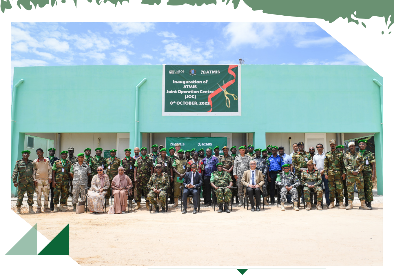
Senior personnel from UN, FGS and ATMIS Military and Police in a group photo in front of the newly opened JOC at the at Force headquarters in Mogadishu, - 8 October, 2022.