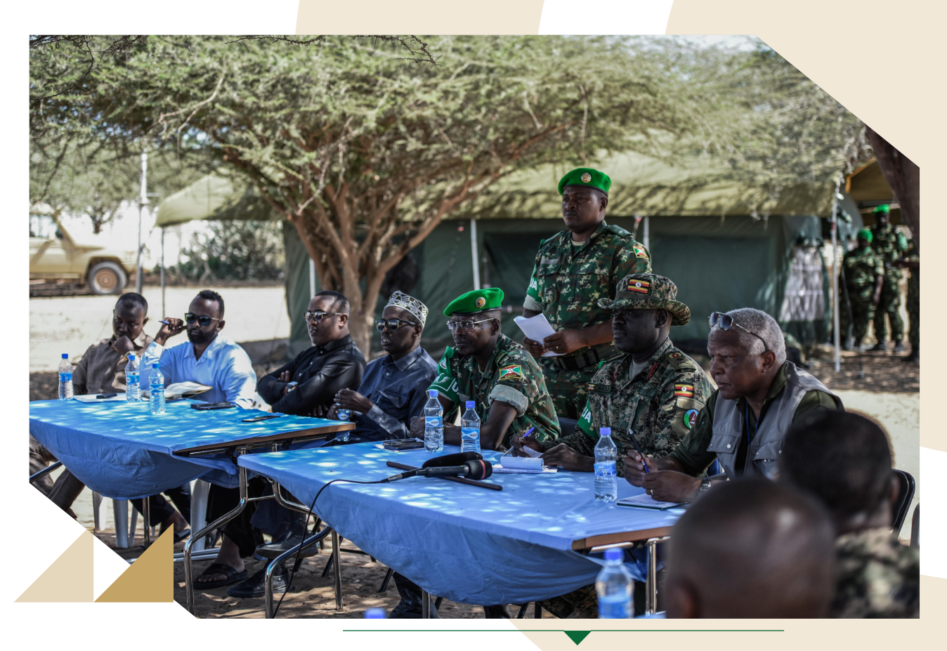
Senior military officers of the African Union Transition Mission in Somalia (ATMIS), and local community leaders, during a meeting at the Bal'ad Forward Operating Base (FOB), in Hirshabelle State. - 25 January, 2023.